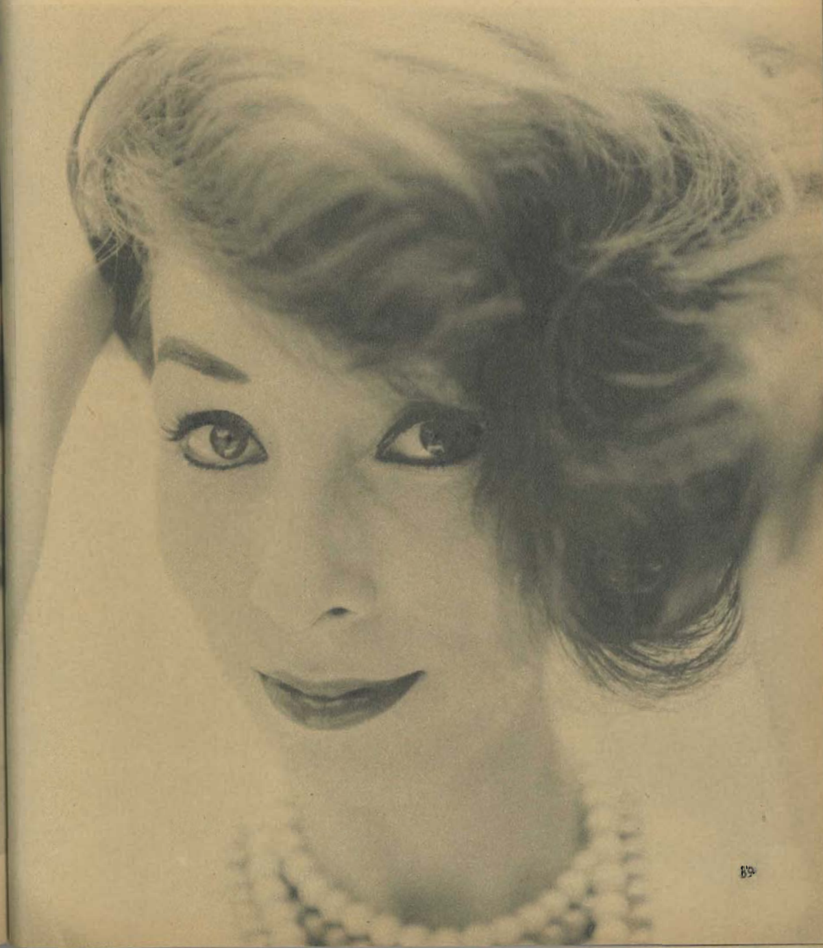
A high-fashion feeling is conveyed with use of natural lighting in PORTRAIT by George Wisner. Taken with Rolleiflex in studio against roll paper background.