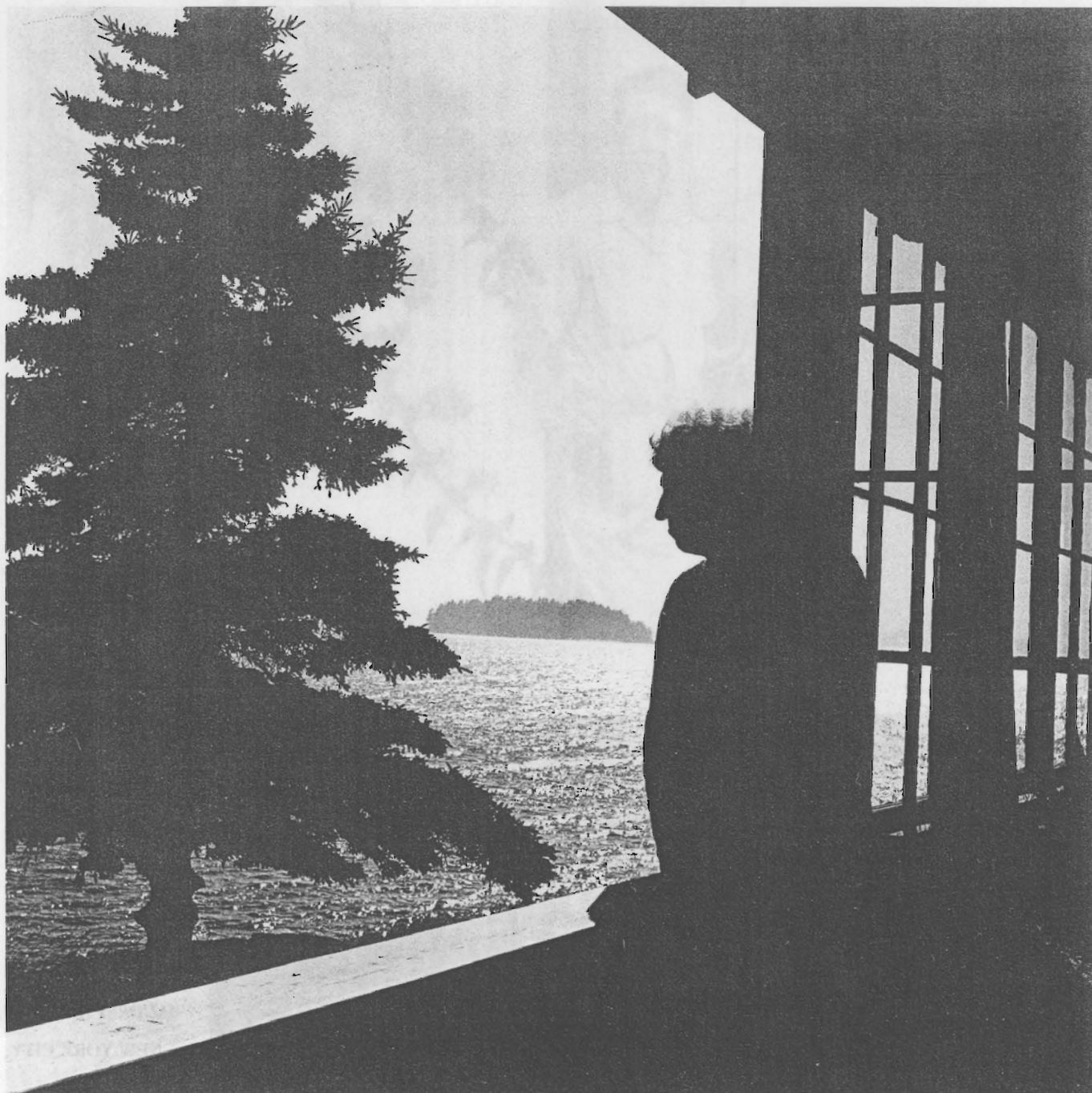
JOHN MARIN, CAPE SPLIT, MAINE, 1951