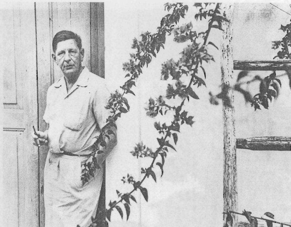
W.H. AUDEN, ISCHIA, 1955