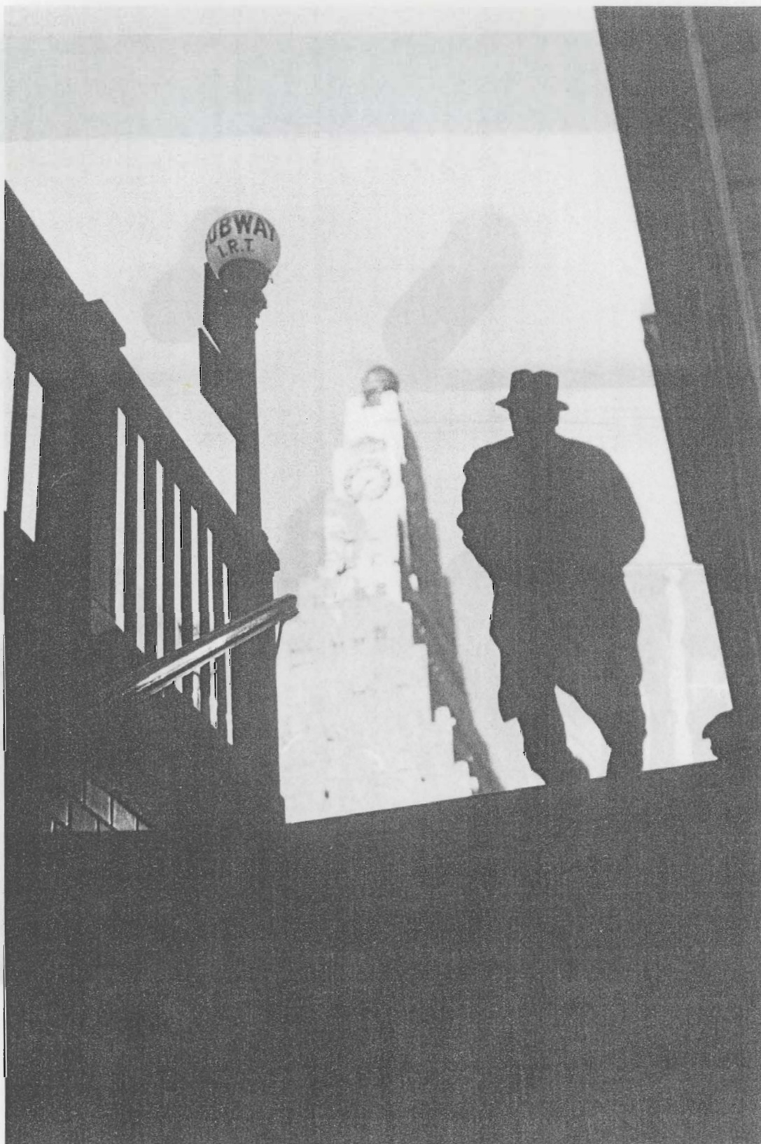
MAN LEAVING SUBWAY.