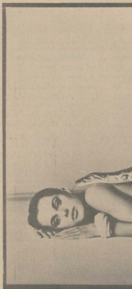
"Nastassja Kinski and the S

12914 VALLEYHEART DRIVE, SUITE 6 12914 VALLEYHEART DRIVE, SUITE 6 P.O. BOX 1168-871 STUDIO CITY, CA 91604 TEL: (818) 990-1082 FAX: (818) 990-1083 SERVICE: 1 (800) 972-2242